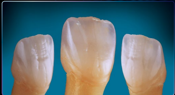
Restorations courtesy of Mitch Hurst CDT, DTG

GC Initial LiSi, is a new member of the popular ceramic line of Initial. This new ceramic is a specialized veneering ceramic designed for lithium disilicate frameworks. With these types of frameworks gaining popularity, GC now offers a material for highly aesthetic and durable restorations for long-term patient satisfaction.